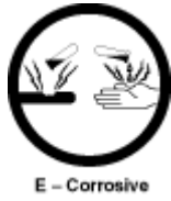
E - Corrosive