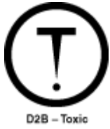
D2B - Toxic

D2B - Toxic materials, Eye irritation Class E : Corrosive to aluminum. Not corrosive to animal skin or carbon steel.